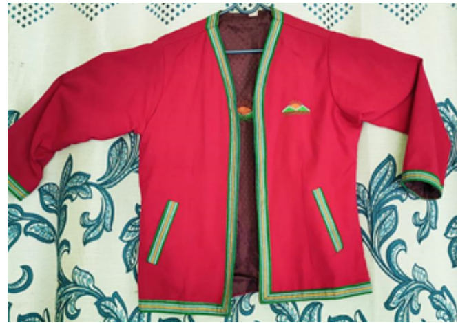
Coat - Local Name: Galok