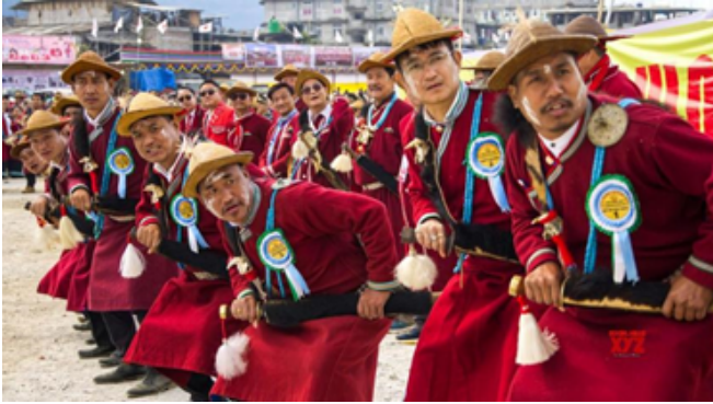
Male Costume Local Name: Jibu/Jitv Laklak

Men may accessorize with beaded necklaces, bracelets, and other items of cultural significance.