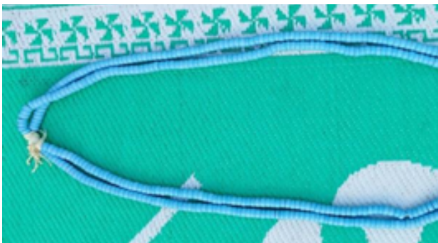
Wearable Beads Local Name: Tassing