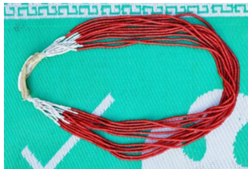
Local Name: Tamin/Singmin