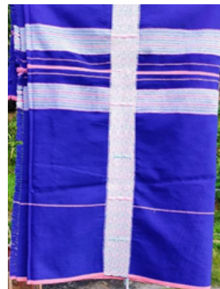
Wrapper Local Name: Gale