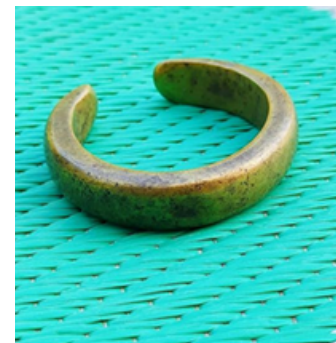
Wrist Bangle Local Name : Kopung