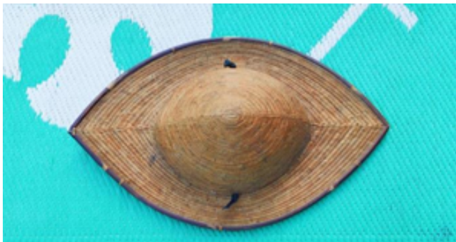
Male Headgear - Botung